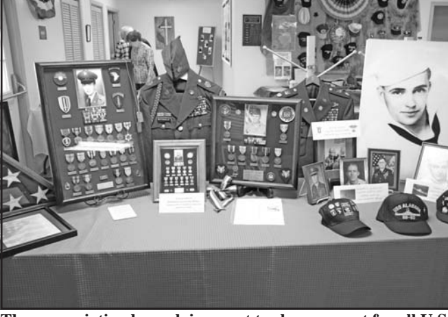
The appreciation brunch is meant to show respect for all U.S. military, both current veterans and those who have passed on, as well as active duty service members.

Part of what makes the Coosa event so special is the involvement of the veterans who attend the church.